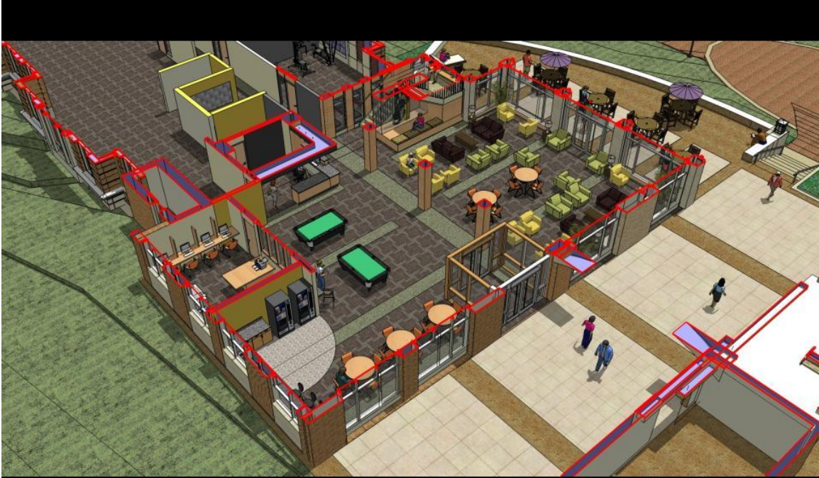
Phase 1 – Enlarged Floor Plans